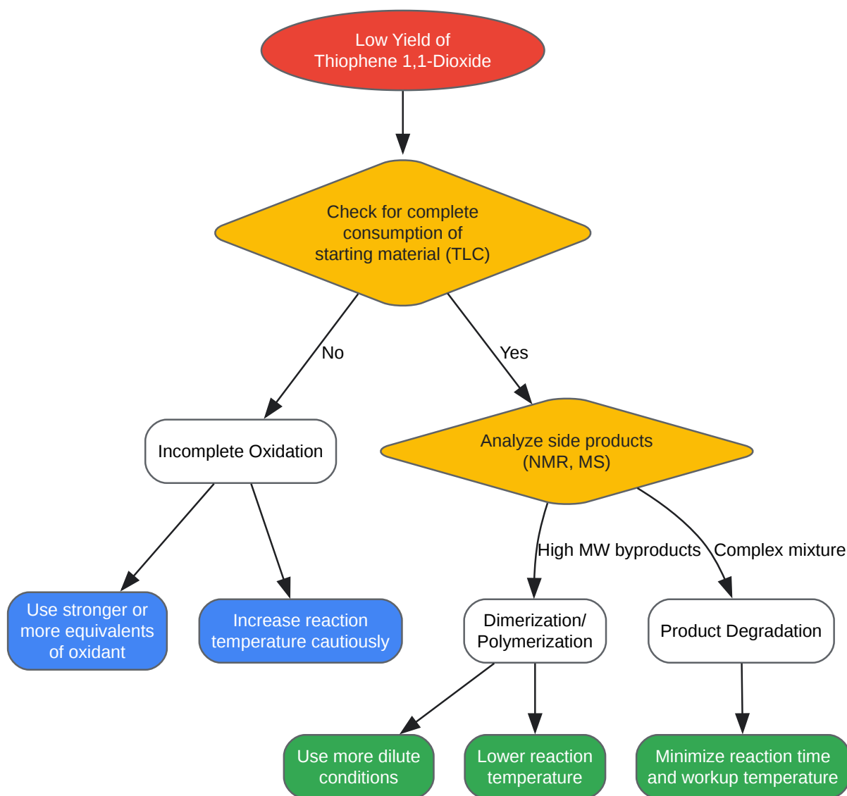
Diagram 3: Troubleshooting Logic for Low Yield

Click to download full resolution via product page