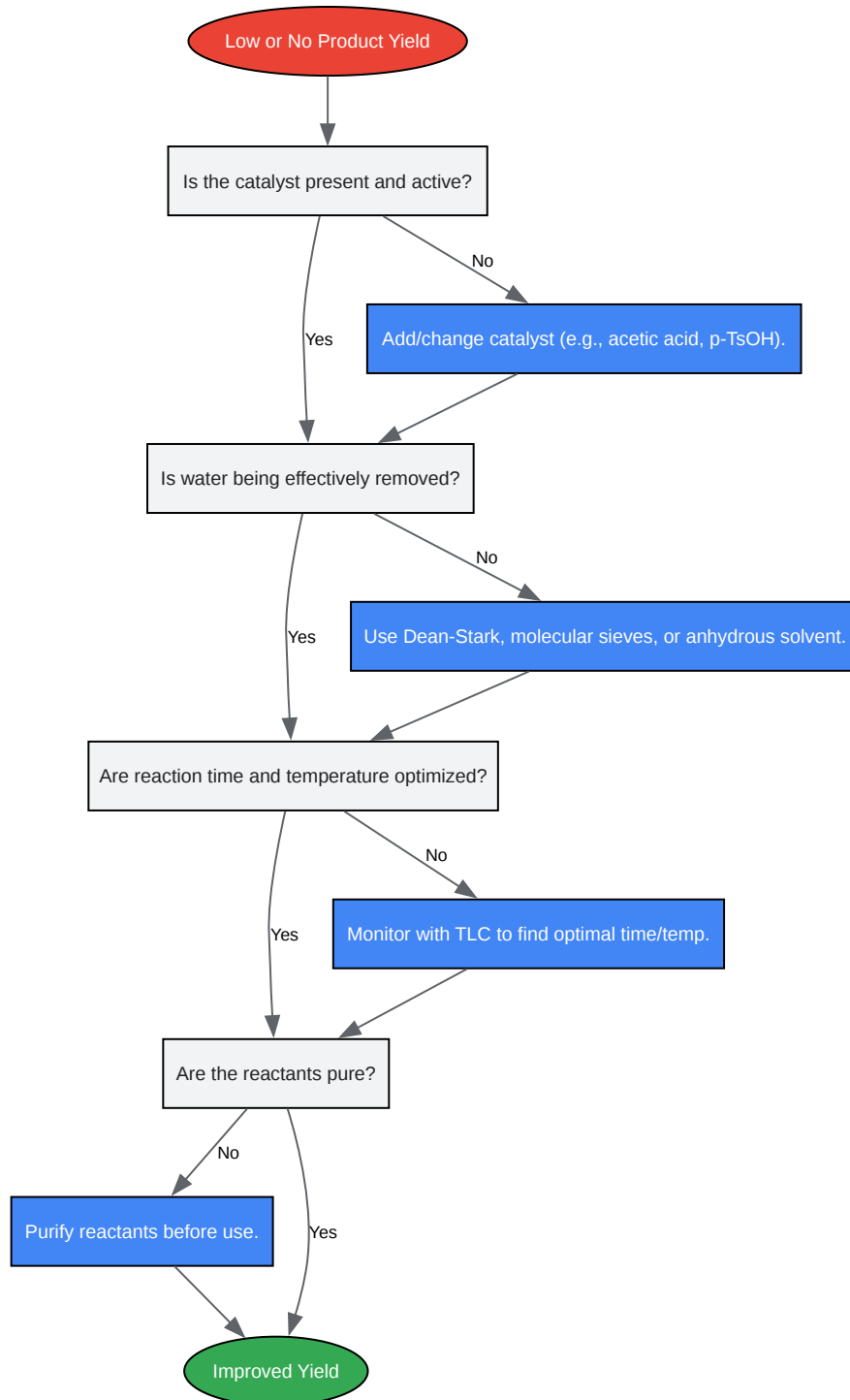
Troubleshooting Flowchart for Low Yield