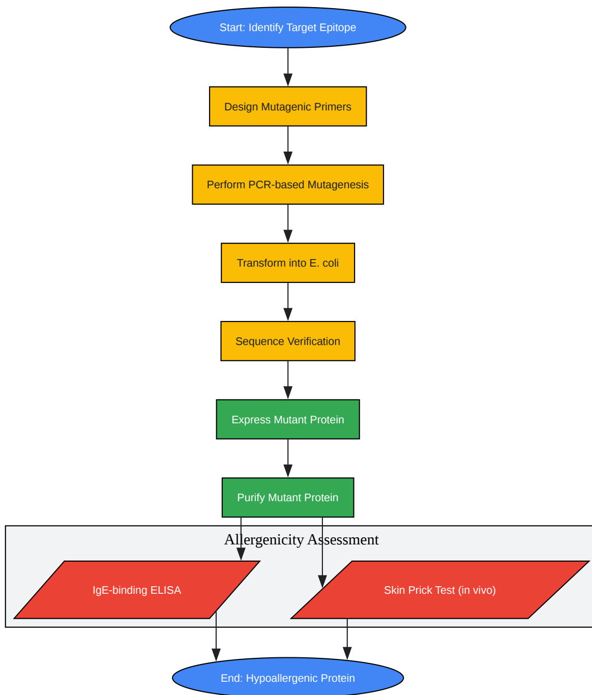
Figure 1: Signaling pathway of a Type I hypersensitivity reaction initiated by Hevein .

Click to download full resolution via product page