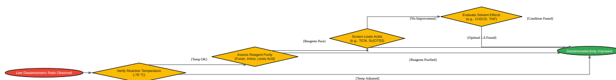
Diagram 1: Troubleshooting Logic for Low Diastereoselectivity

Click to download full resolution via product page