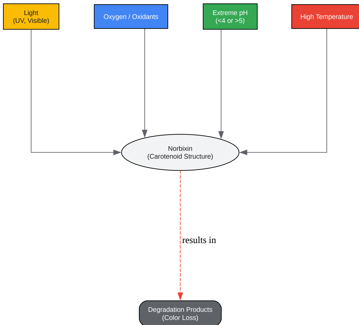
Key Factors Leading to Norbixin Degradation

Click to download full resolution via product page