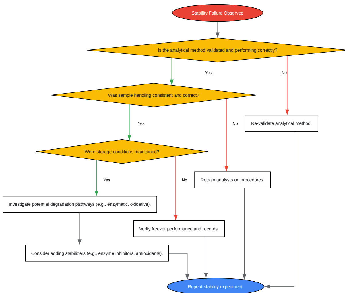
Caption: Workflow for assessing the stability of an analyte in a biological matrix.

Click to download full resolution via product page