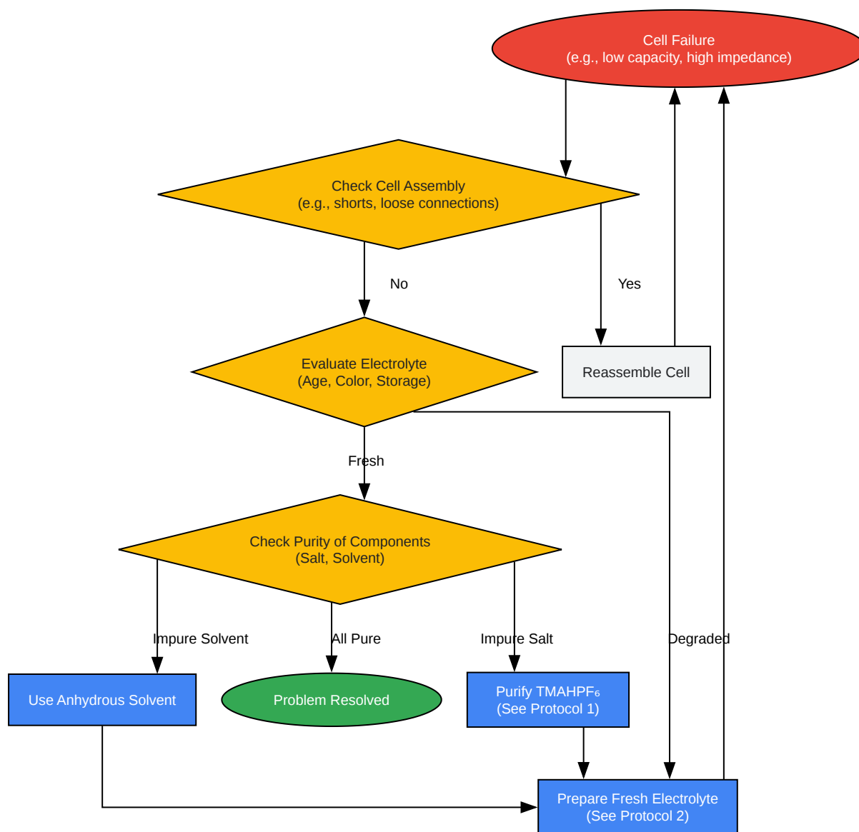
Troubleshooting Workflow for Electrochemical Cell Failure

Click to download full resolution via product page