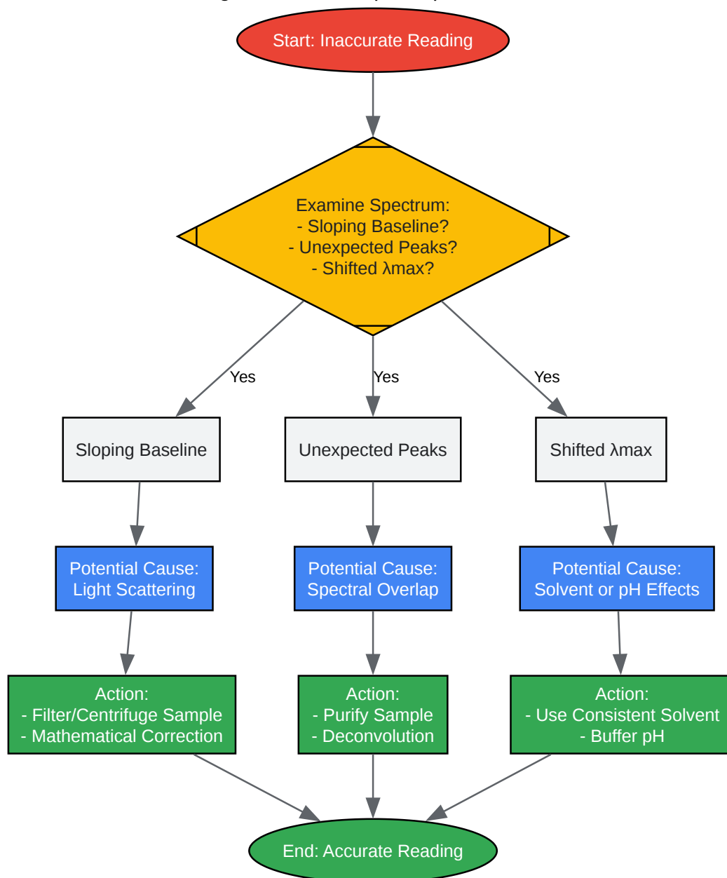
Troubleshooting Workflow for Spectrophotometric Interference