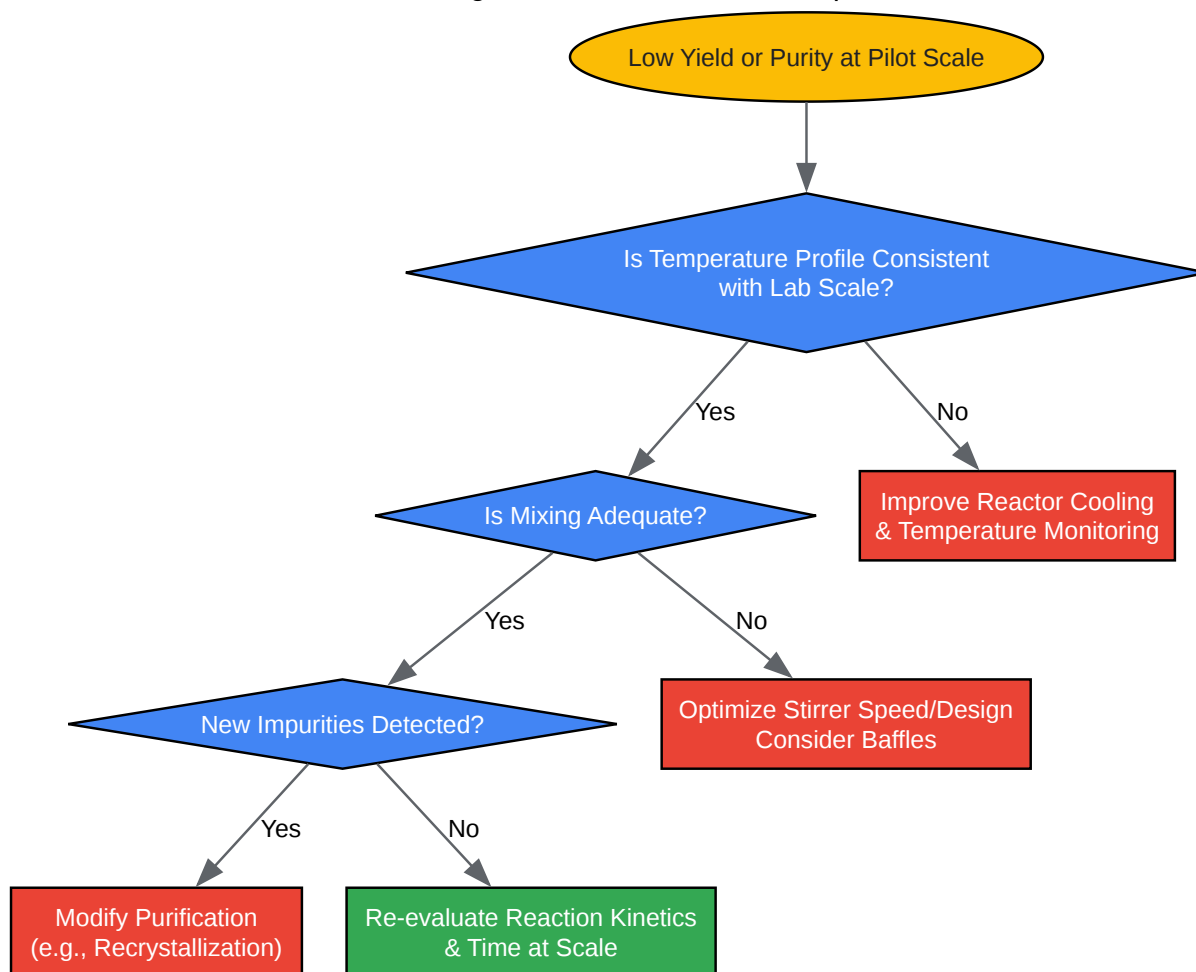
Troubleshooting Decision Tree for Scale-Up Issues

Click to download full resolution via product page