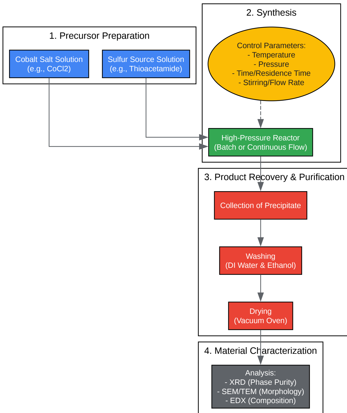
General Workflow for Scaled-Up Co 3 S 4 Synthesis