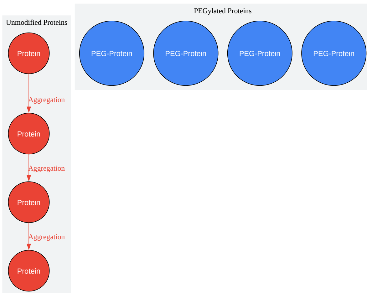
Mechanism of Aggregation Prevention

Click to download full resolution via product page