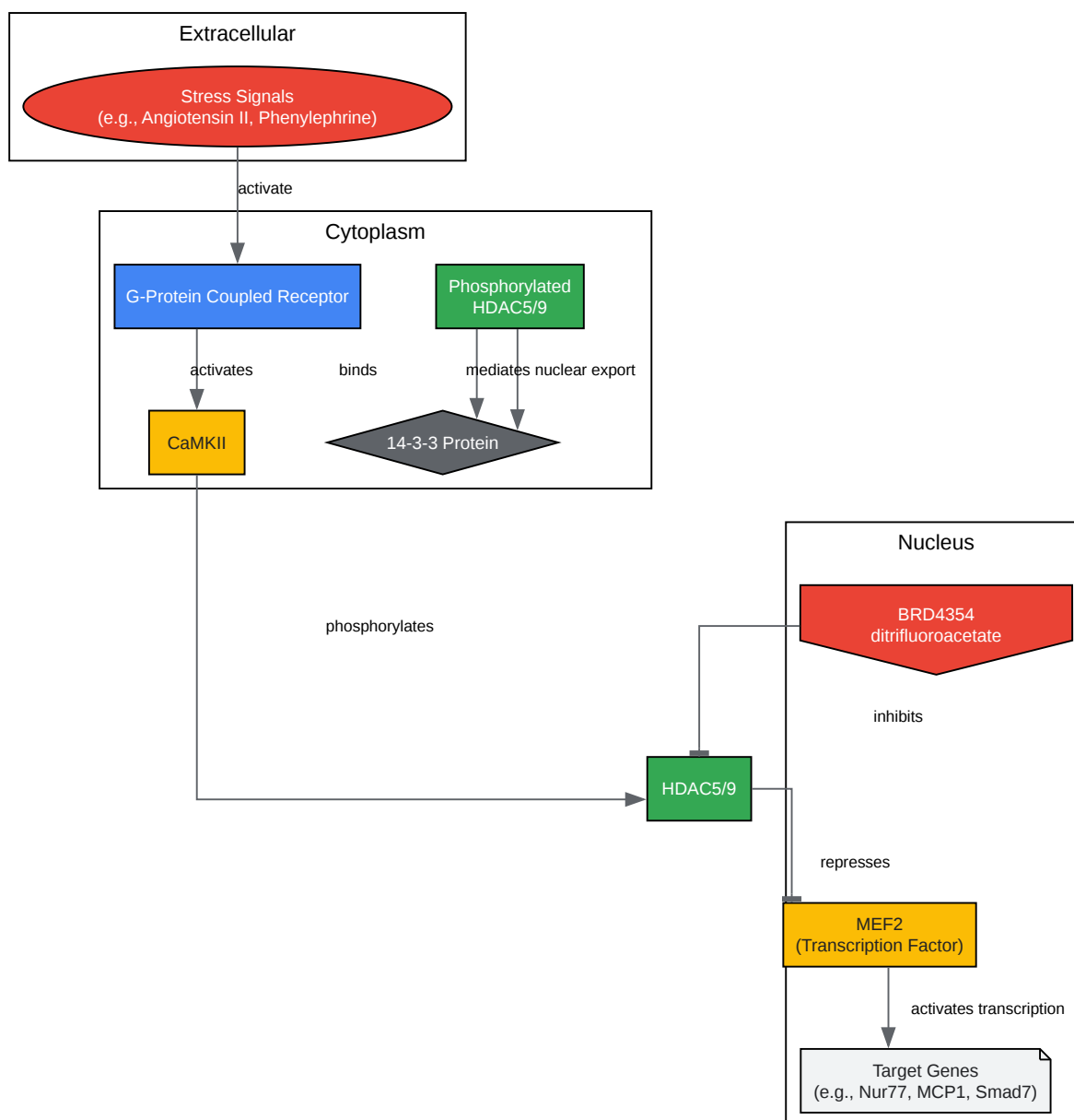
HDAC5/9 Signaling Pathway