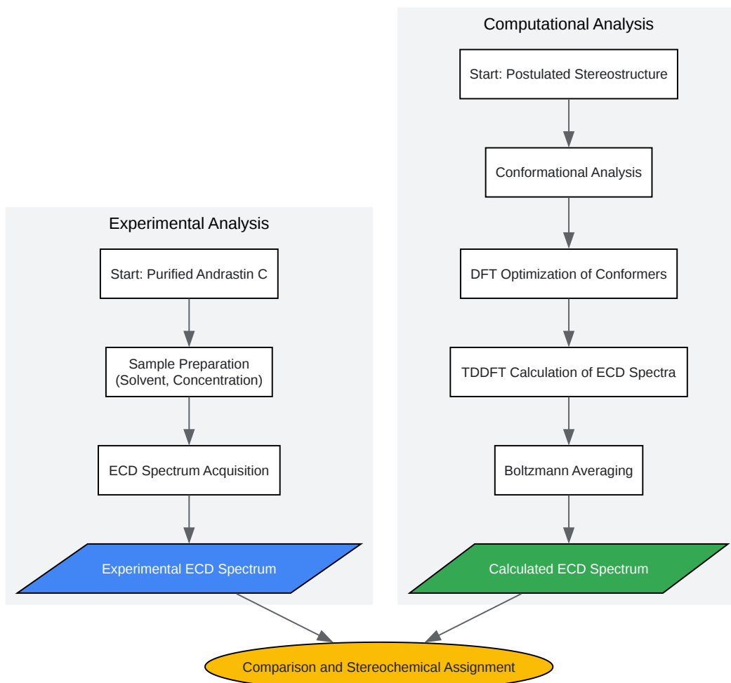
Overall Workflow for Stereochemical Assignment of Andrastin C using ECD

Click to download full resolution via product page