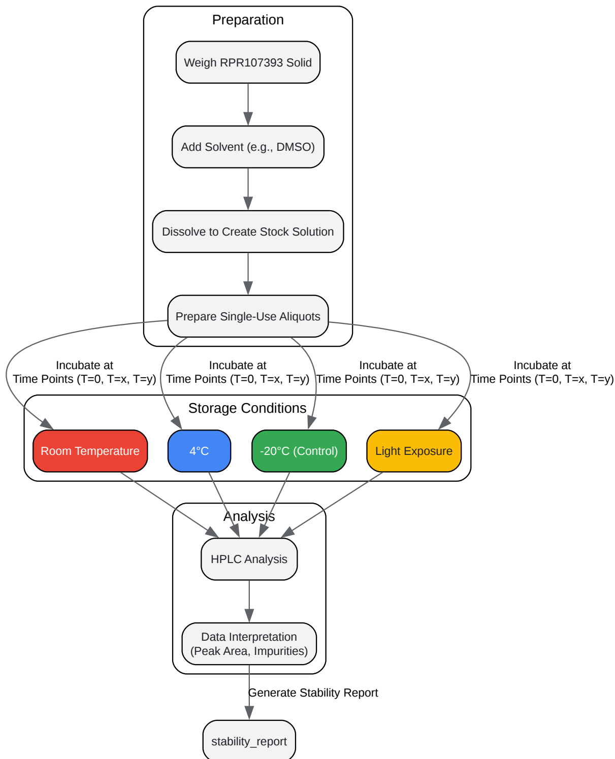
Workflow for RPR107393 Solution Stability Assessment

Click to download full resolution via product page