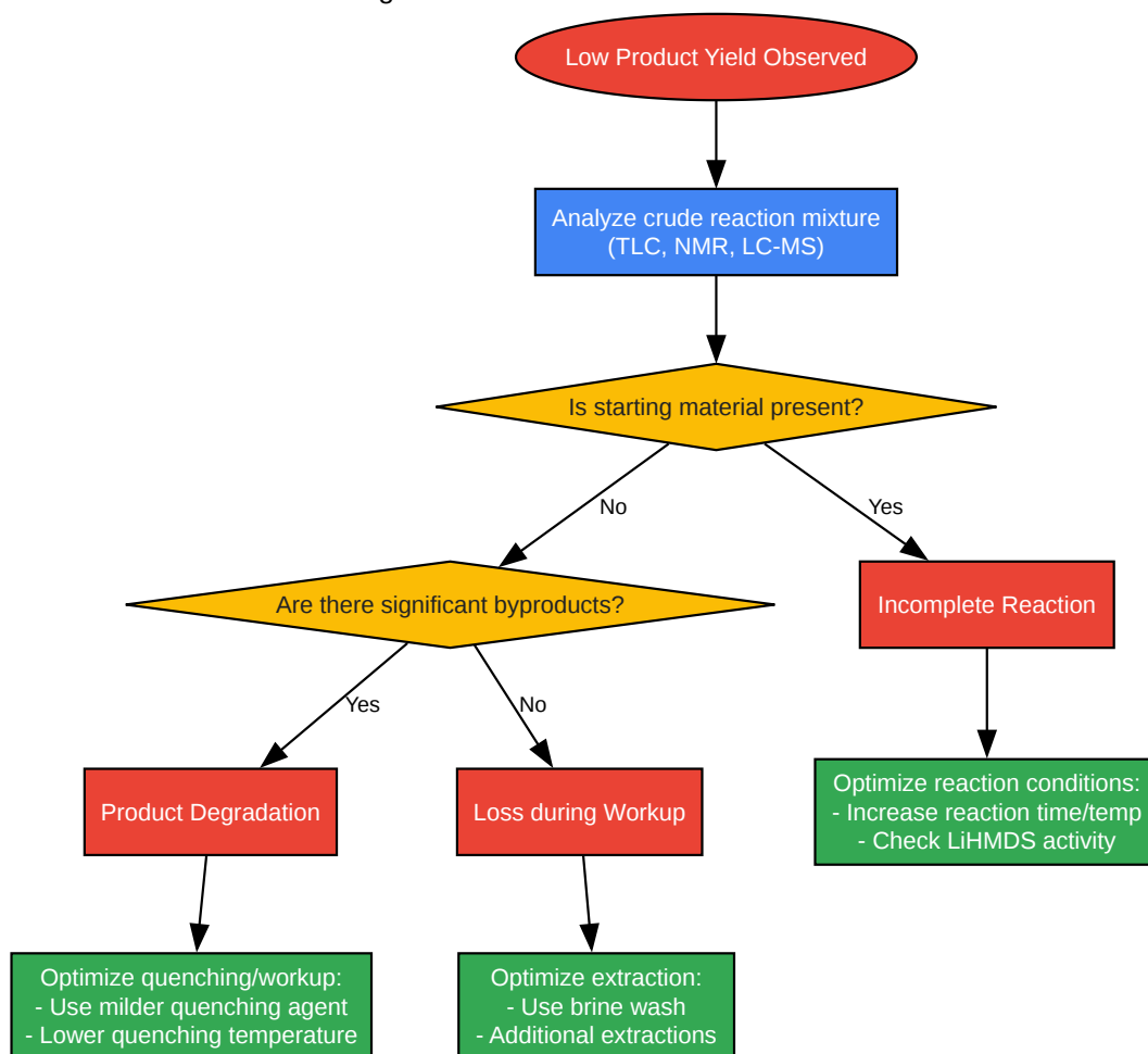
Troubleshooting Flowchart for Low Yield in LiHMDS Reactions