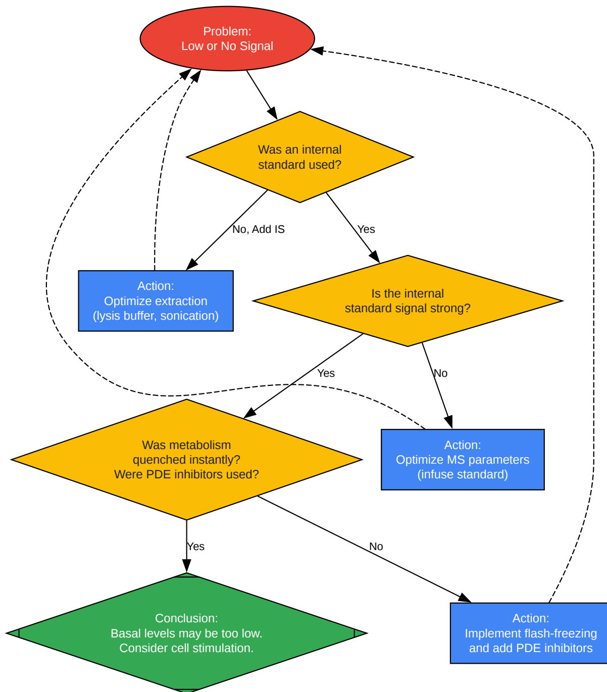
Figure 2: Troubleshooting decision tree for low c-tri-AMP signal.

Click to download full resolution via product page