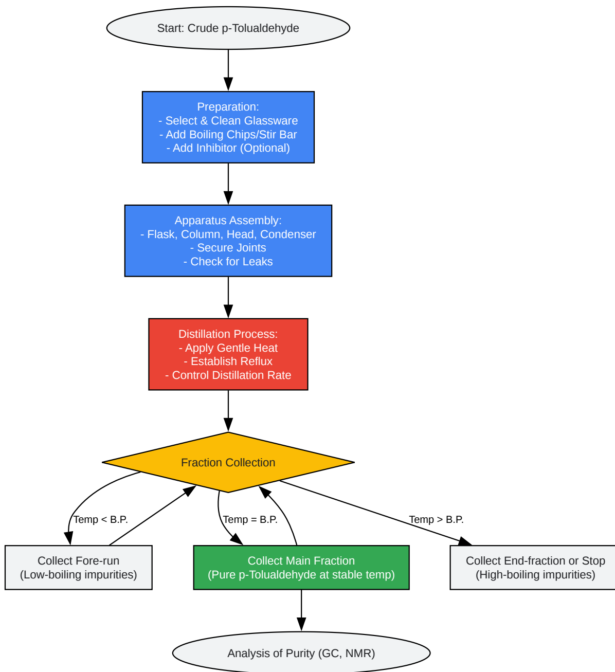
Caption: Troubleshooting flowchart for fractional distillation.

Click to download full resolution via product page