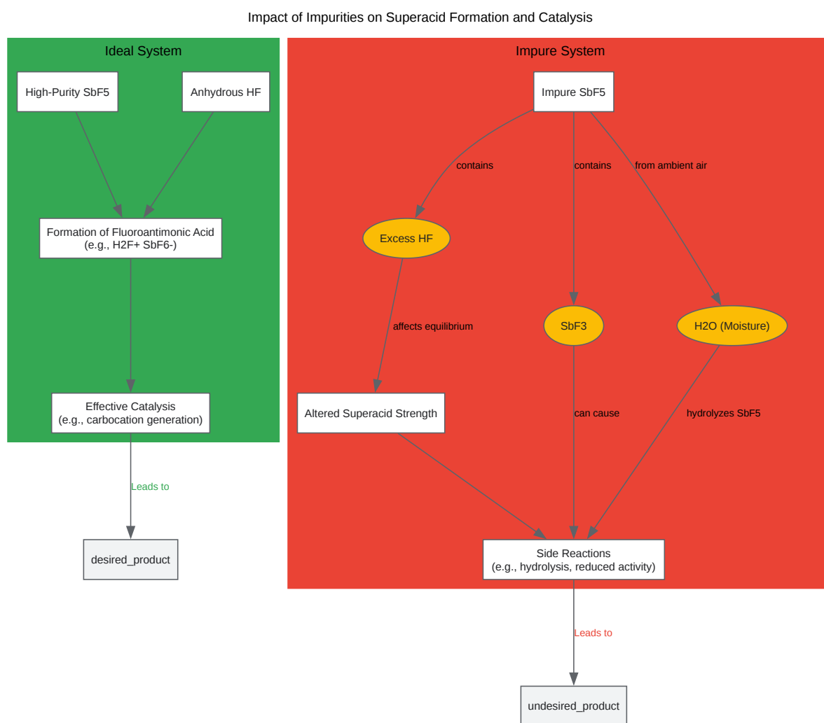
Figure 1. Experimental workflow for the purification and subsequent use of antimony pentafluoride .