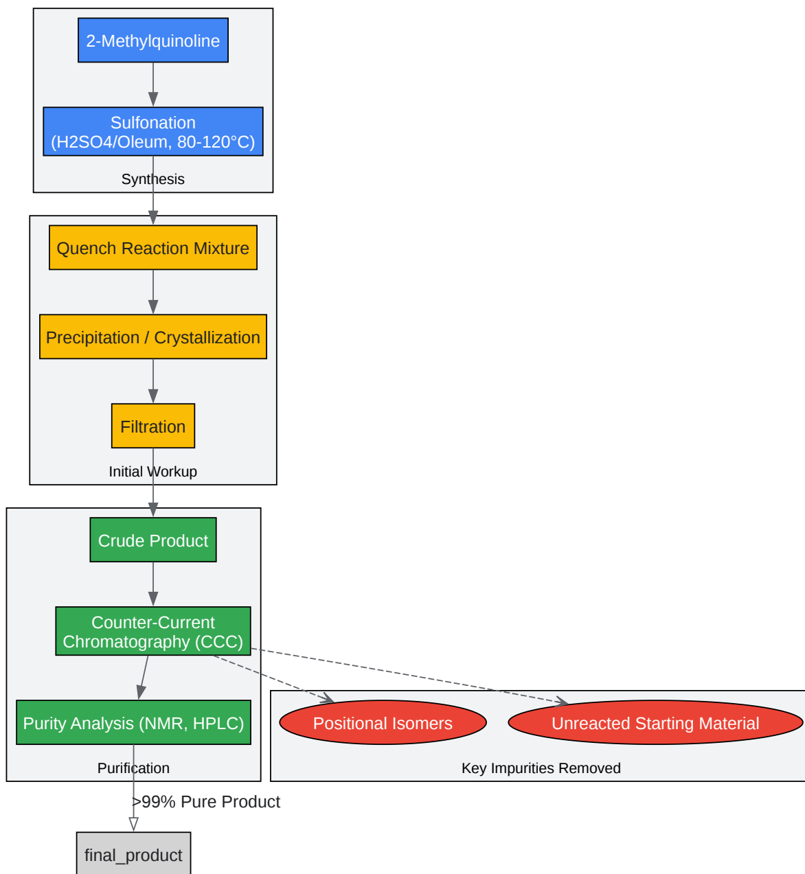
Diagram 1: Synthesis and Purification Workflow

Click to download full resolution via product page