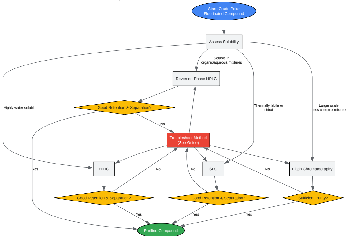
Figure 1. Decision Tree for Purification Strategy Selection

Click to download full resolution via product page