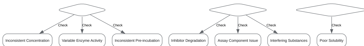
Caption: Workflow for Biochemical and Cell-Based 3CLpro Inhibition Assays.

Click to download full resolution via product page