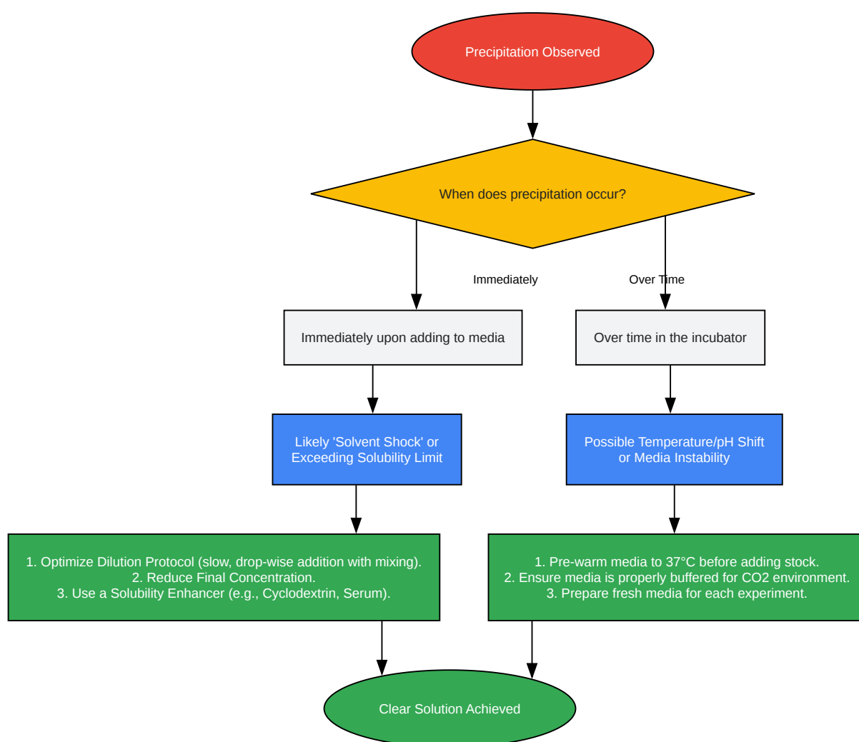
Diagram: Troubleshooting Workflow for Agathic Acid Precipitation

Click to download full resolution via product page