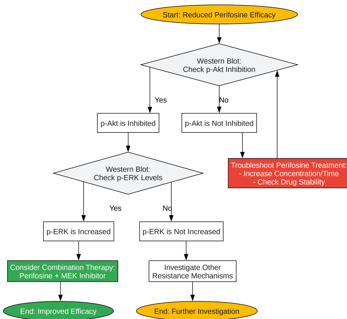
Figure 1: Compensatory activation of the MAPK/ERK pathway upon Perifosine -mediated Akt inhibition.