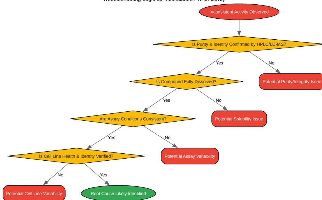
Troubleshooting Logic for Inconsistent PKI 1 Activity

Click to download full resolution via product page