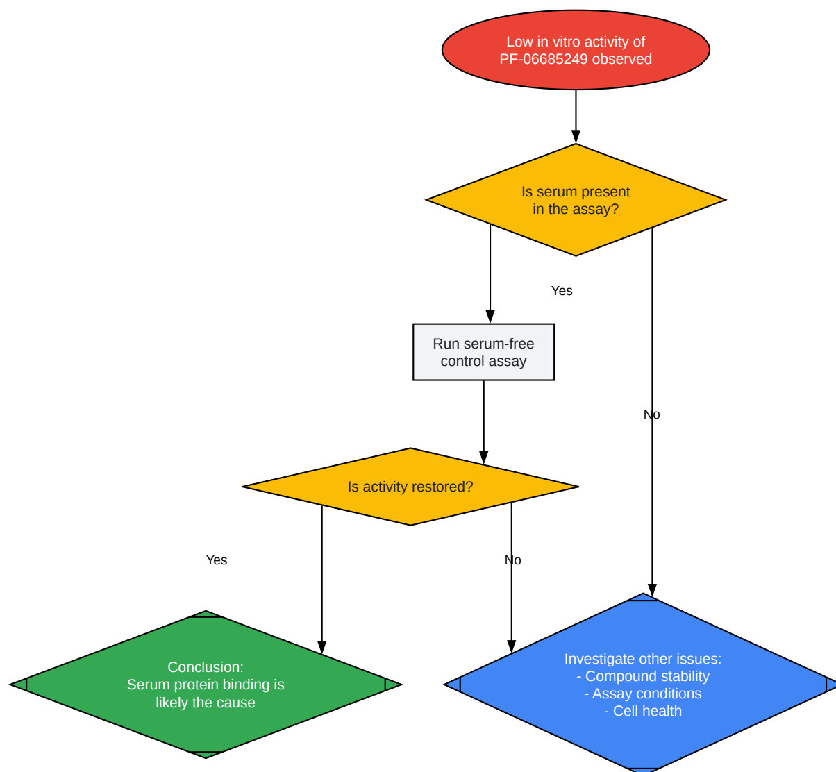
Caption: Workflow for determining the fraction unbound (fu) of PF-06685249 .

Click to download full resolution via product page