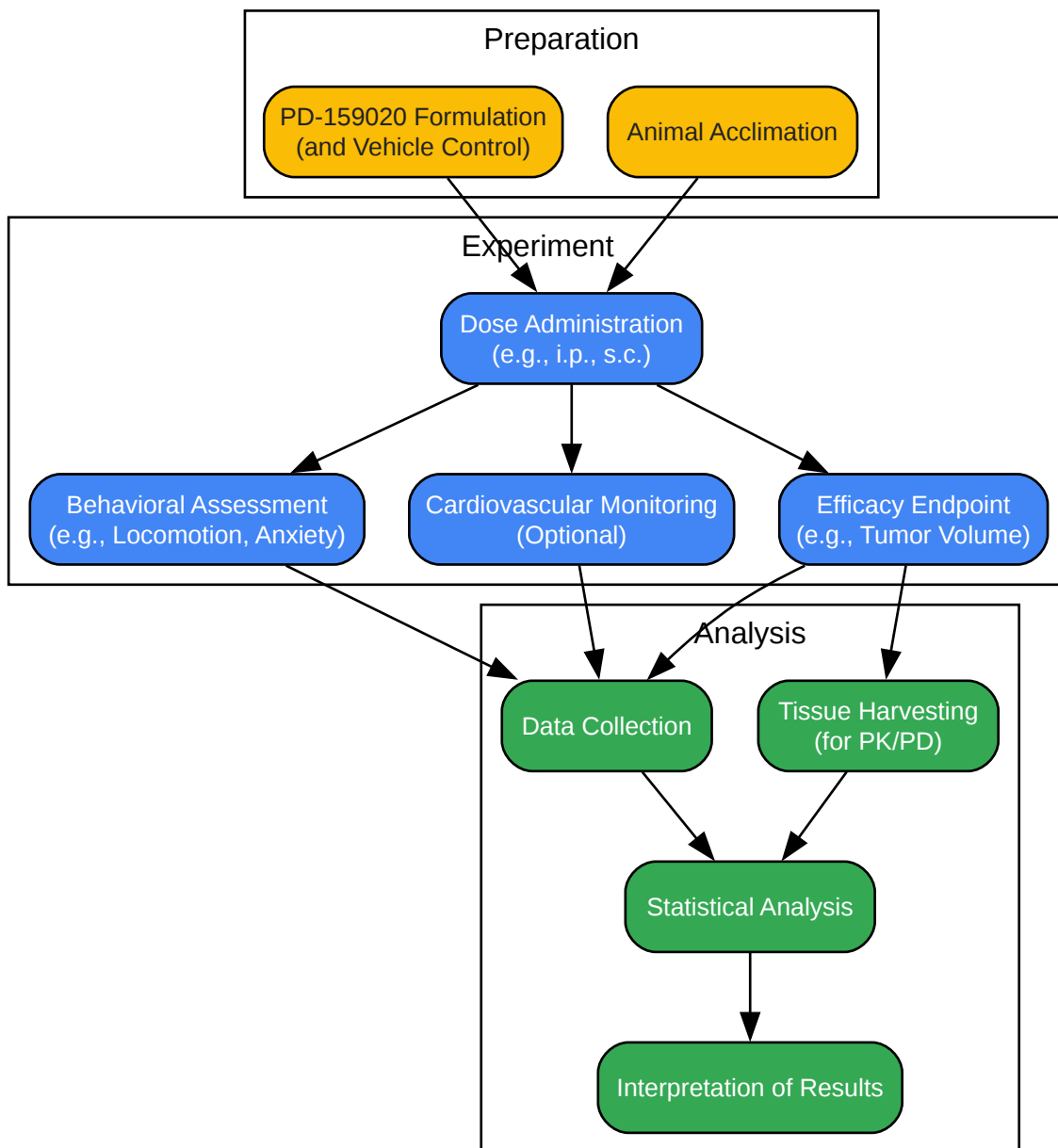
General In Vivo Experimental Workflow for PD-159020

Click to download full resolution via product page