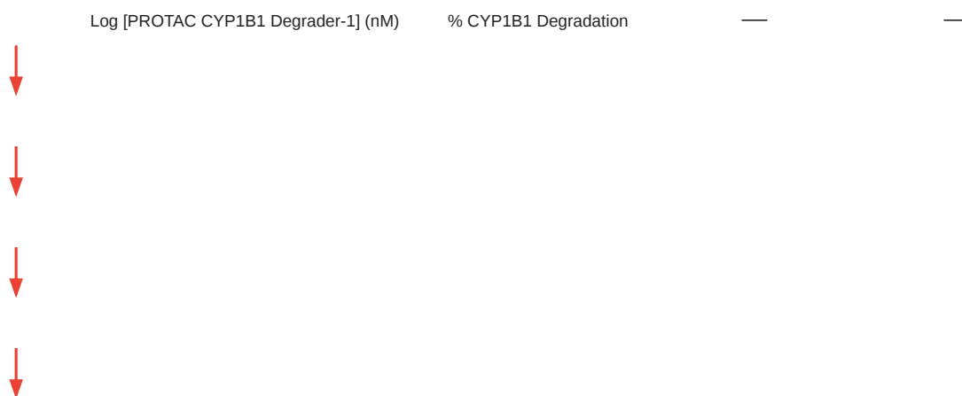
Fig. 1: Hypothetical Dose-Response Curve with Hook Effect

Click to download full resolution via product page