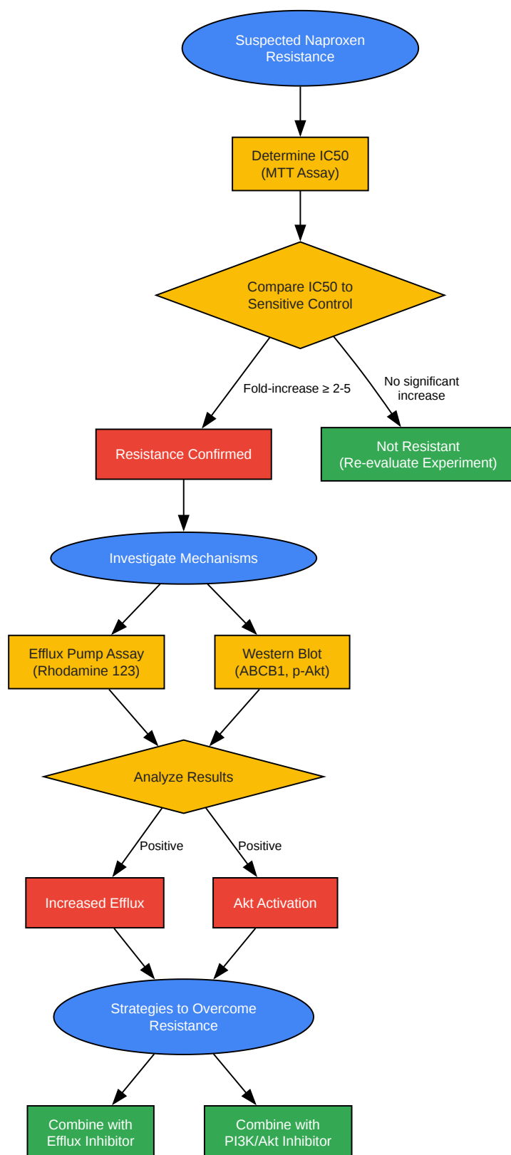
Caption: Mechanisms of naproxen action and resistance in a cancer cell.

Click to download full resolution via product page