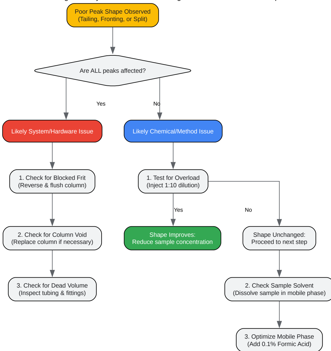
Diagram 1: Systematic Troubleshooting Workflow for Poor Peak Shape

Click to download full resolution via product page