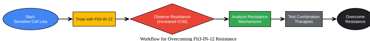
Caption: Overview of on-target and off-target resistance mechanisms to Flt3-IN-12 .

Click to download full resolution via product page