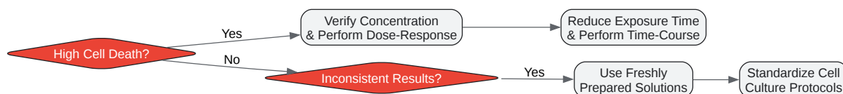
Caption: Experimental workflow for optimizing emetine treatment.

Click to download full resolution via product page