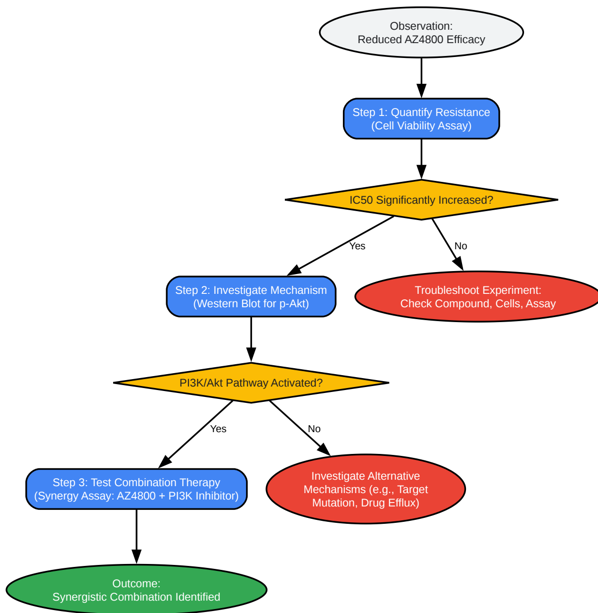
Workflow for characterizing AZ4800 resistance.

Click to download full resolution via product page