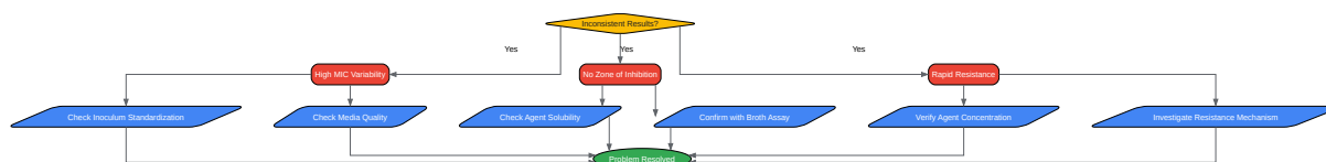
Caption: Workflow for MIC Determination.

Click to download full resolution via product page