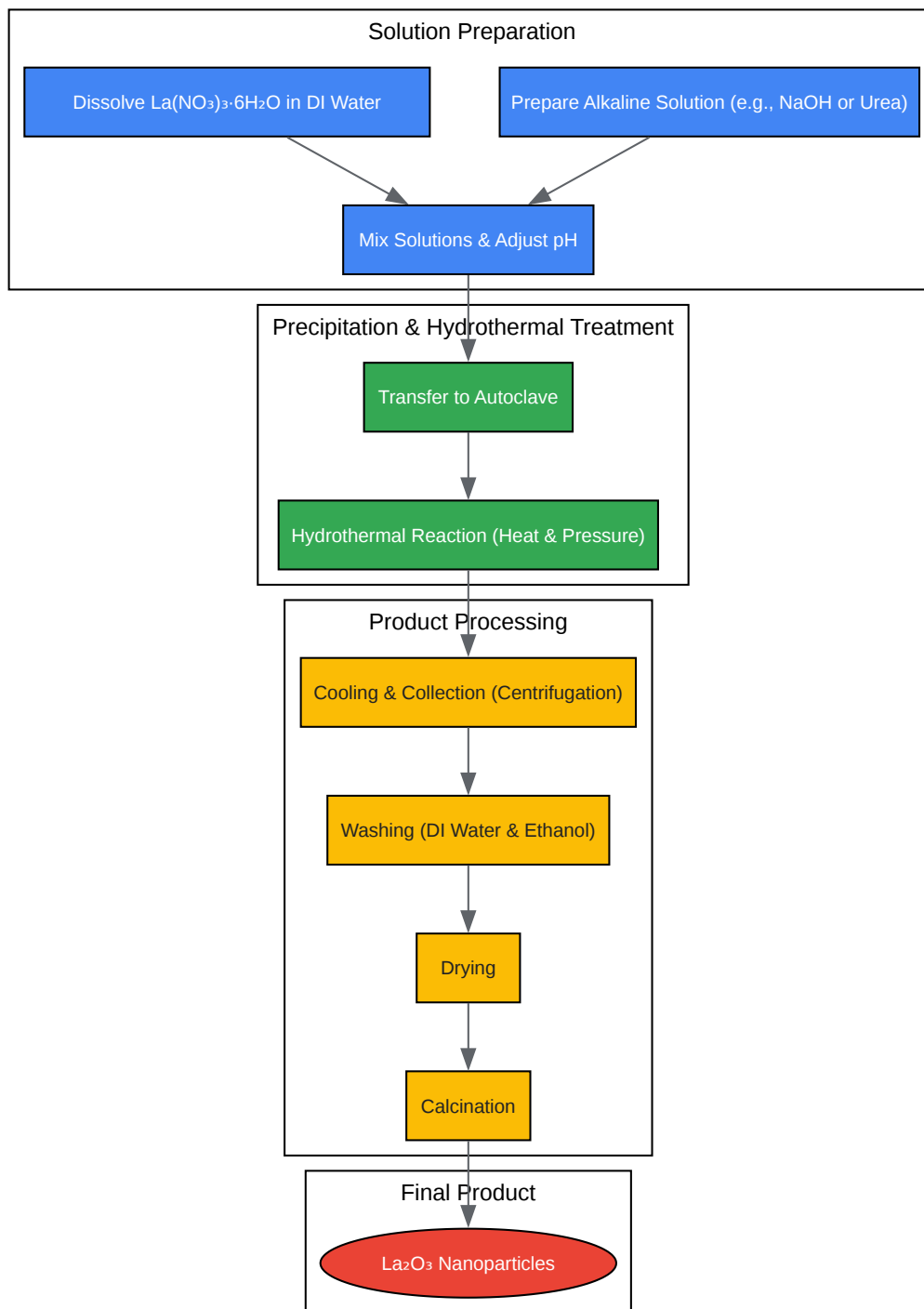
Figure 1. Experimental Workflow for Hydrothermal Synthesis of \text{La}_2\text{O}_3

Click to download full resolution via product page