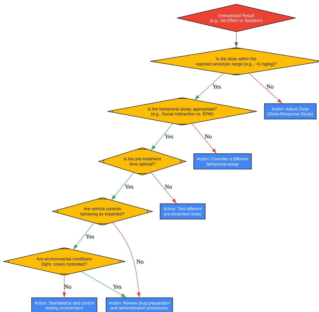
Figure 3: Troubleshooting Logic for Unexpected Results

Click to download full resolution via product page