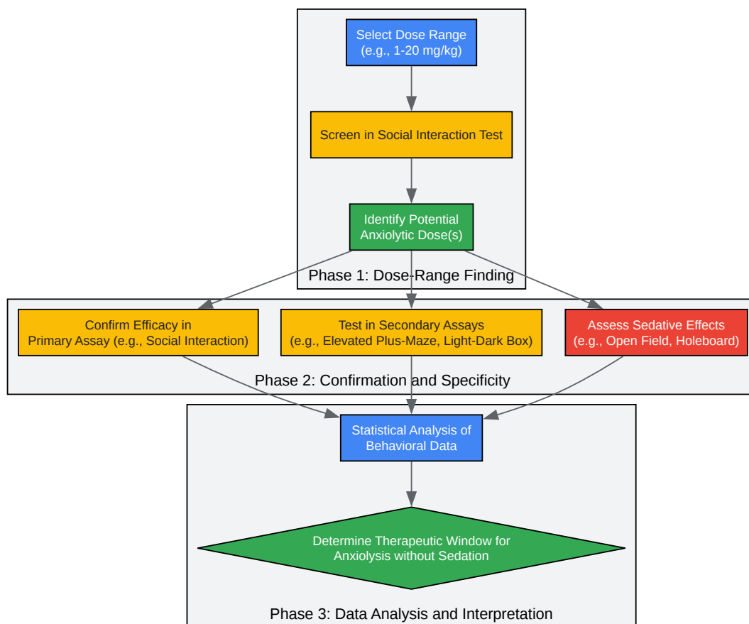
Figure 2: Experimental Workflow for Dose Optimization

Click to download full resolution via product page