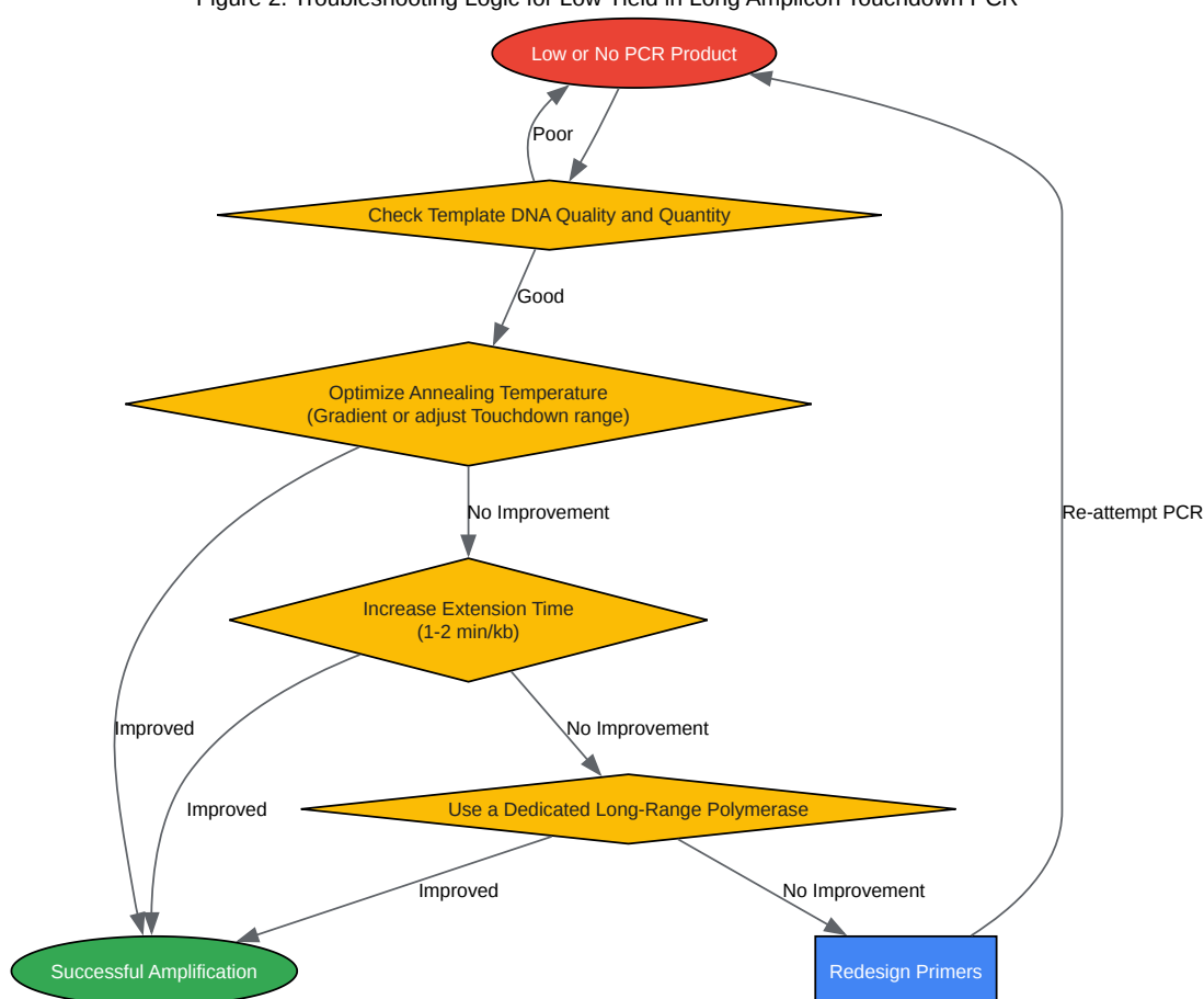
Figure 2. Troubleshooting Logic for Low Yield in Long Amplicon Touchdown PCR

Caption: Figure 1. A flowchart illustrating the key stages of a Touchdown PCR experiment for long amplicons.