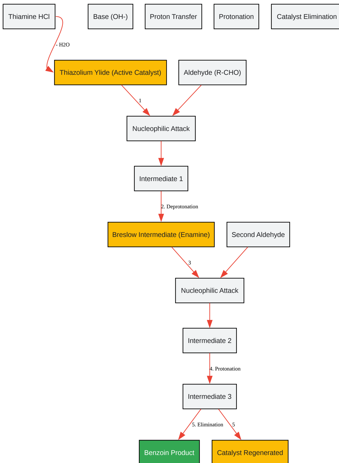
Caption: General experimental workflow for thiamine HCl catalysis.

Click to download full resolution via product page