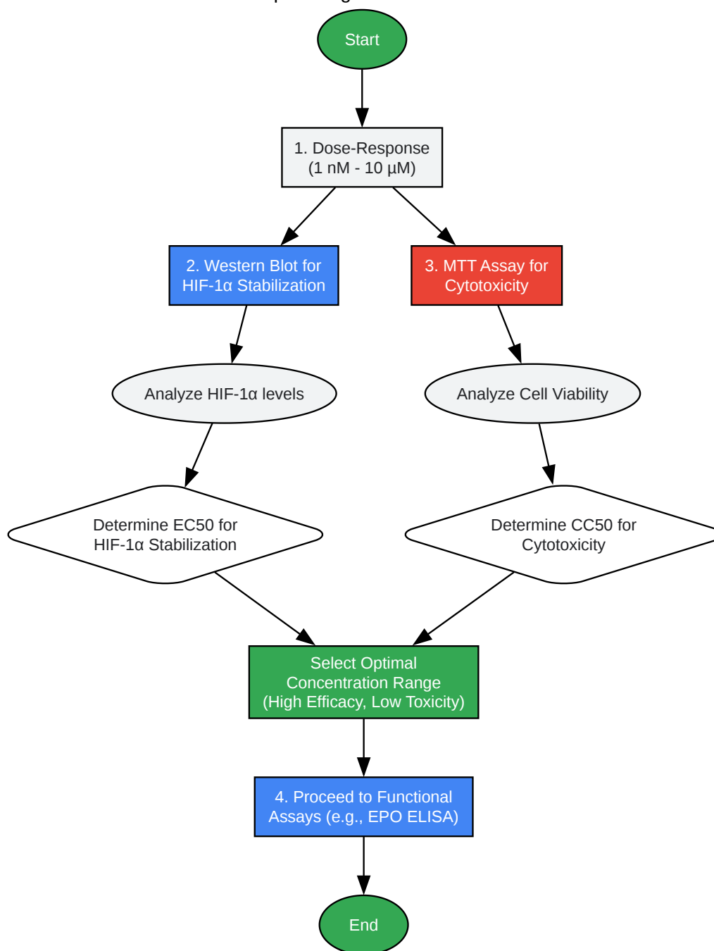
Workflow for Optimizing TP0463518 Concentration

Caption: TP0463518 inhibits PHD enzymes, leading to HIF- \alpha stabilization and increased EPO production.