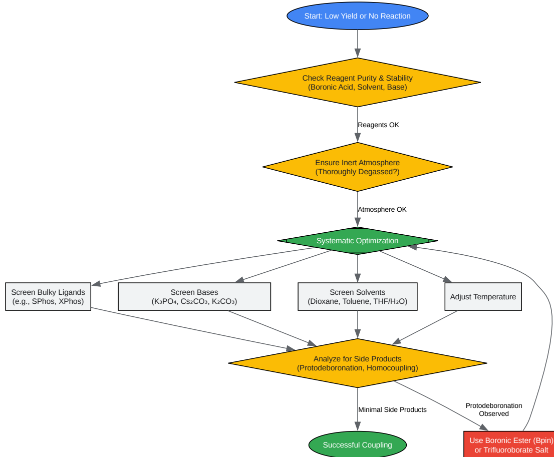
Troubleshooting Flowchart for Suzuki Coupling of 4-Bromopyridines

Click to download full resolution via product page