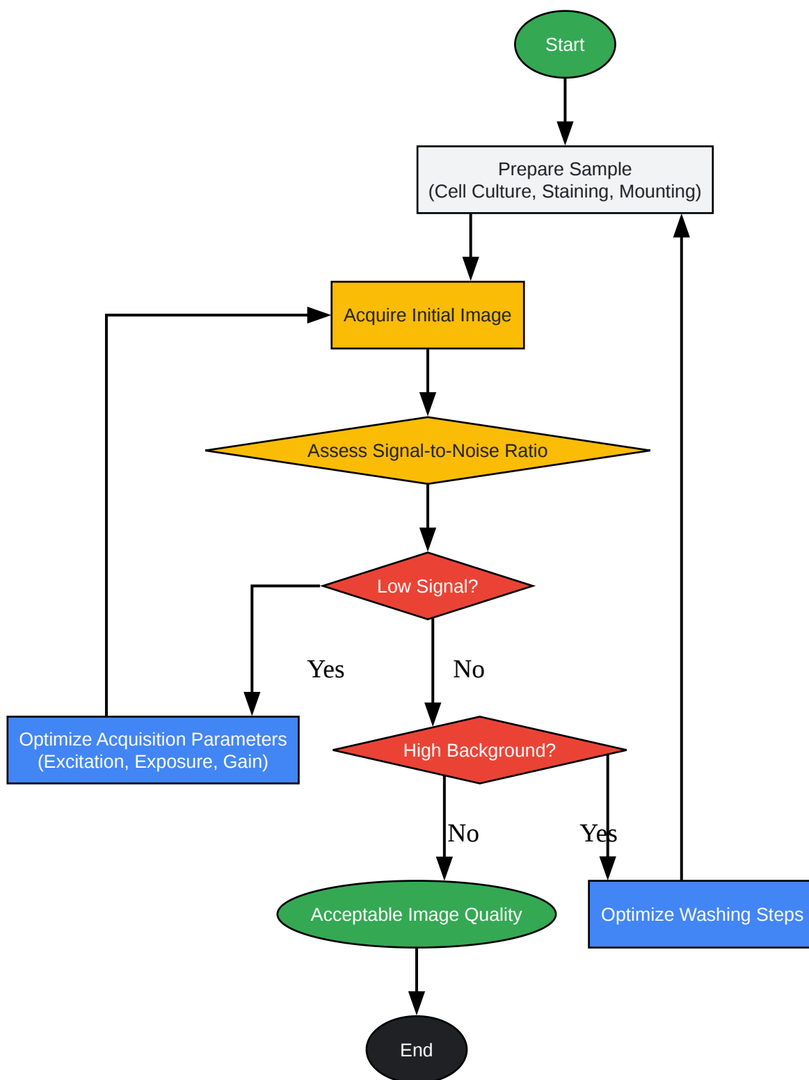
Caption: Retinoic Acid Signaling Pathway.

Click to download full resolution via product page