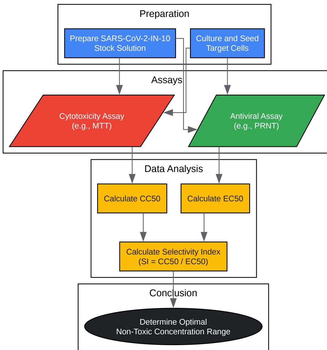
Experimental Workflow for Concentration Optimization