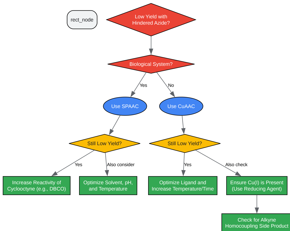
Figure 3. Troubleshooting Logic for Hindered Azide Reactions

Click to download full resolution via product page