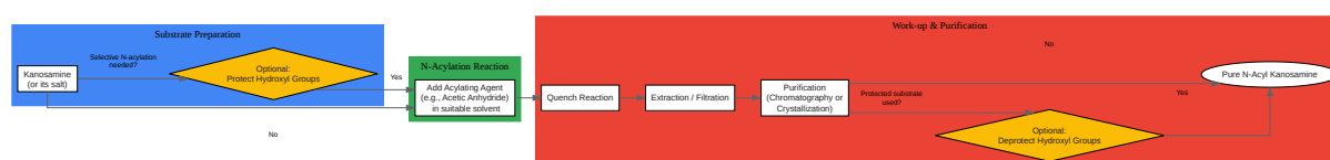
Diagram 1: General Workflow for N-Acylation of Kanosamine