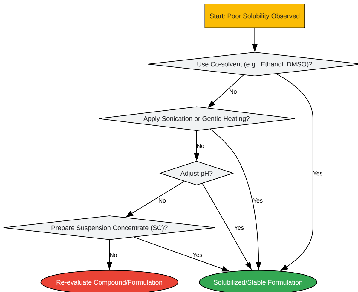
Figure 1: Piazhiole Formulation Troubleshooting Workflow

Click to download full resolution via product page