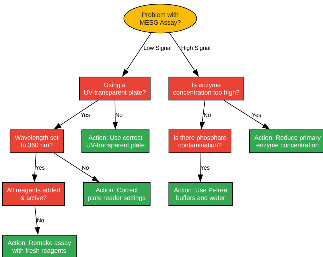
Caption: Workflow for a standard MESG-based enzyme assay.

Click to download full resolution via product page