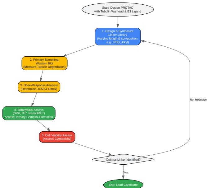
Experimental Workflow for Linker Optimization