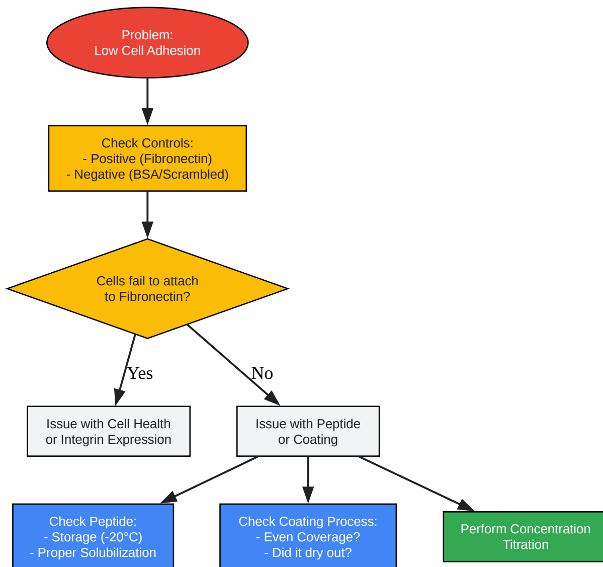
Diagram 3: Troubleshooting Logic for Low Cell Adhesion

Click to download full resolution via product page