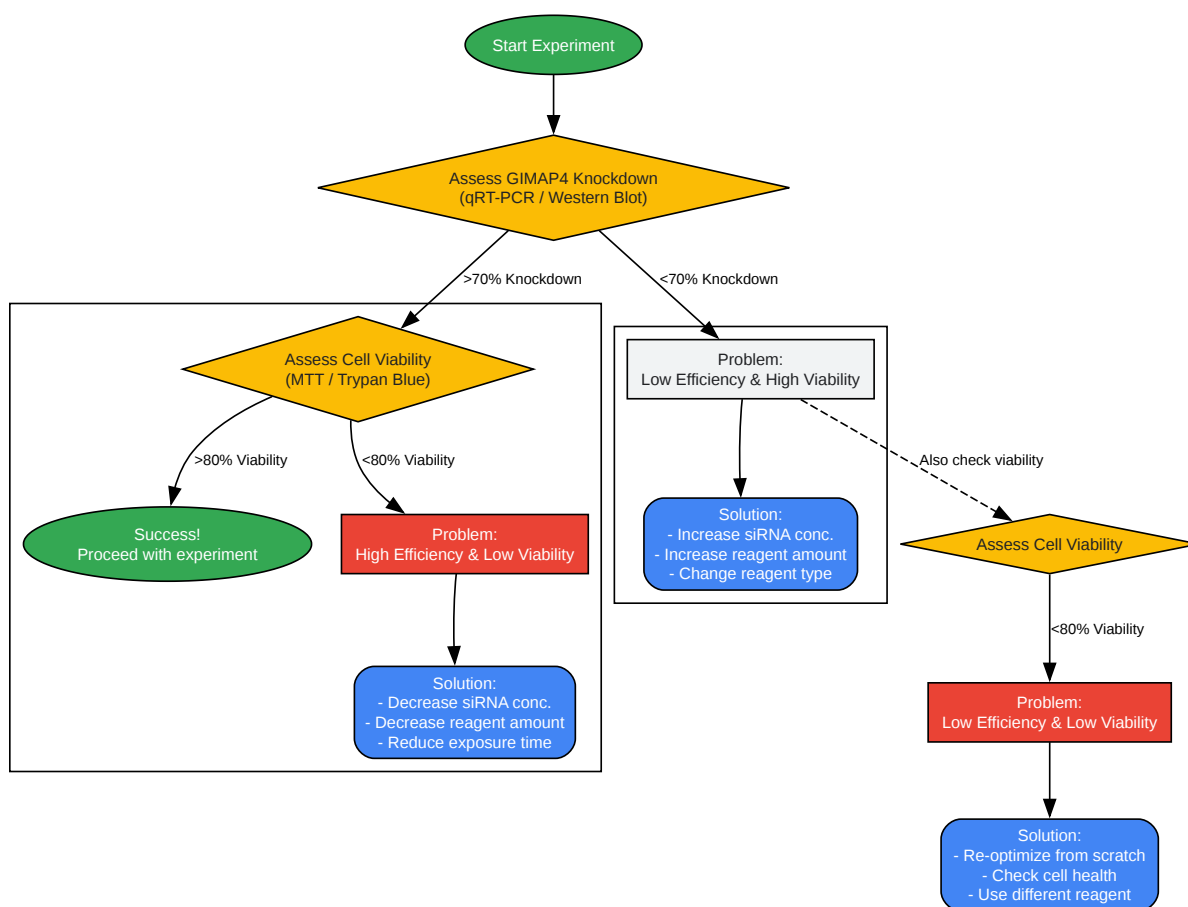
Transfection Troubleshooting Flowchart

Use this decision tree to diagnose and solve common problems during your GIMAP4 transfection experiments.