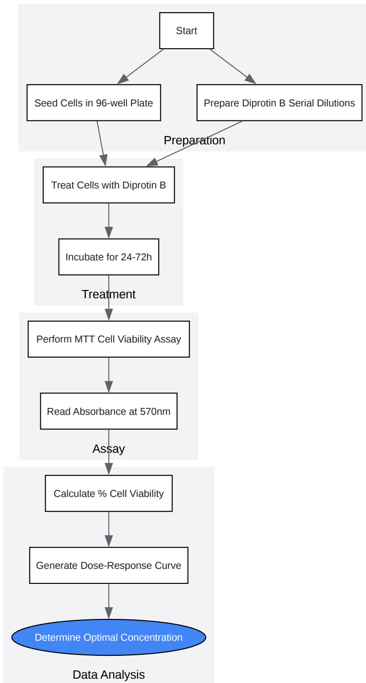
Experimental Workflow for Optimizing Diprotin B Concentration

Click to download full resolution via product page