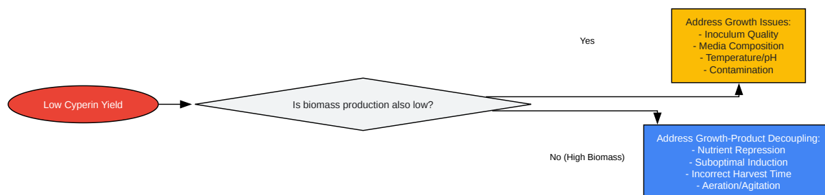
Caption: Workflow for optimizing Cyperin yield.

Click to download full resolution via product page